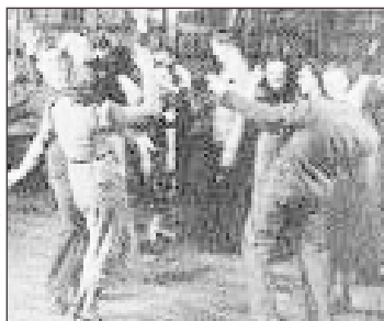
DANCING IN LIBRARY 1938