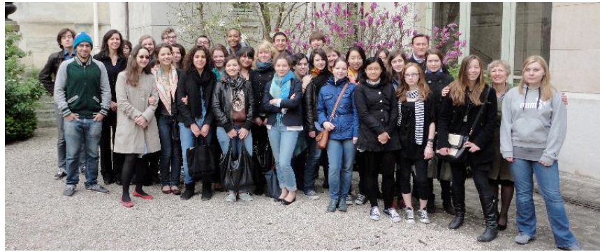
French and American students at Louis Le Grand

Tickets are available for this game for $10/ticket on a first come - first serve basis. The Cubs Walkathon game on April 27th was postponed due to rain and the game re-scheduled. These tickets are valid for admission to the June 27th make-up game. Please contact Marci Levine, marci.levine@sbcglobal.net if you are interested in purchasing tickets. Tickets will be available for purchase until June 21.