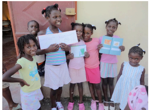
Bon Berger Orphanage - Les Cayes, Haiti, July 2011